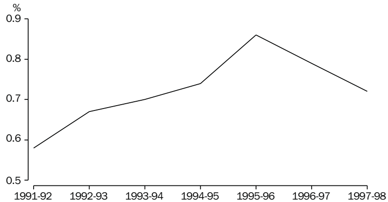
BERD AS A PERCENTAGE OF GDP

The BERD/GDP ratio remained relatively low when compared with other OECD countries as shown in the table below.