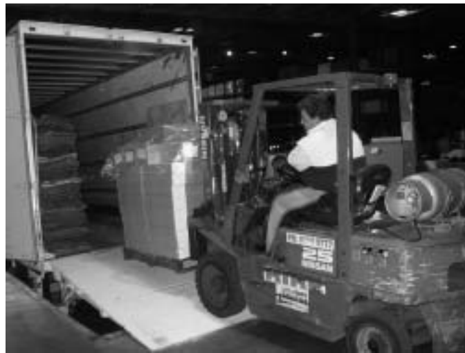
Census forms being loaded for the start of delivery on July 28.

The 2006 Census was officially launched in Canberra on 24 July to herald the start of the delivery of Census forms nationally on 28 July.