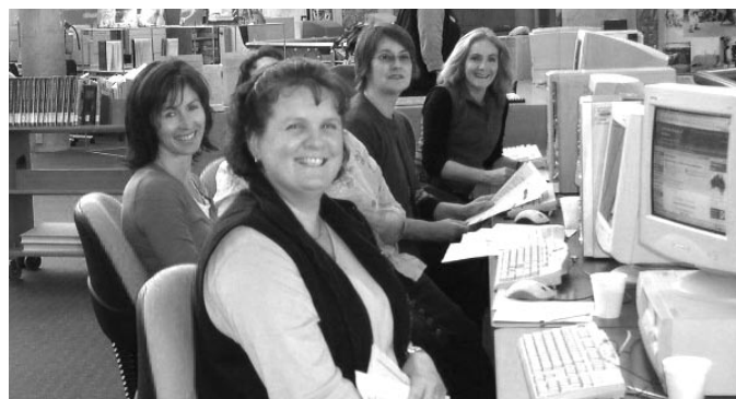
LEP training at Bendigo