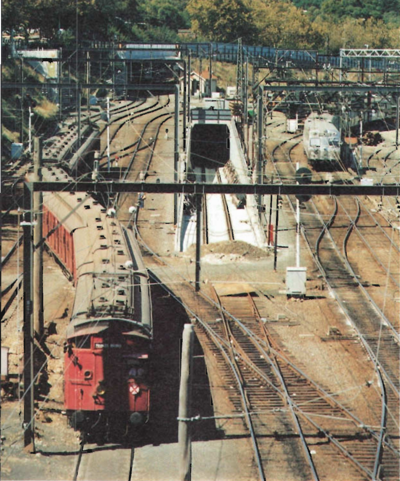
The entrance to the proposed City Circle loop in the Jolimont Railway yards.