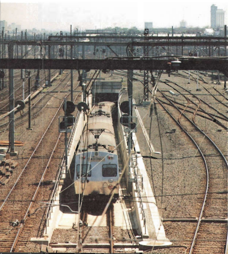
A new stainless steel electric train enters one of the completed underground tunnels of Melbourne's rail loop system.