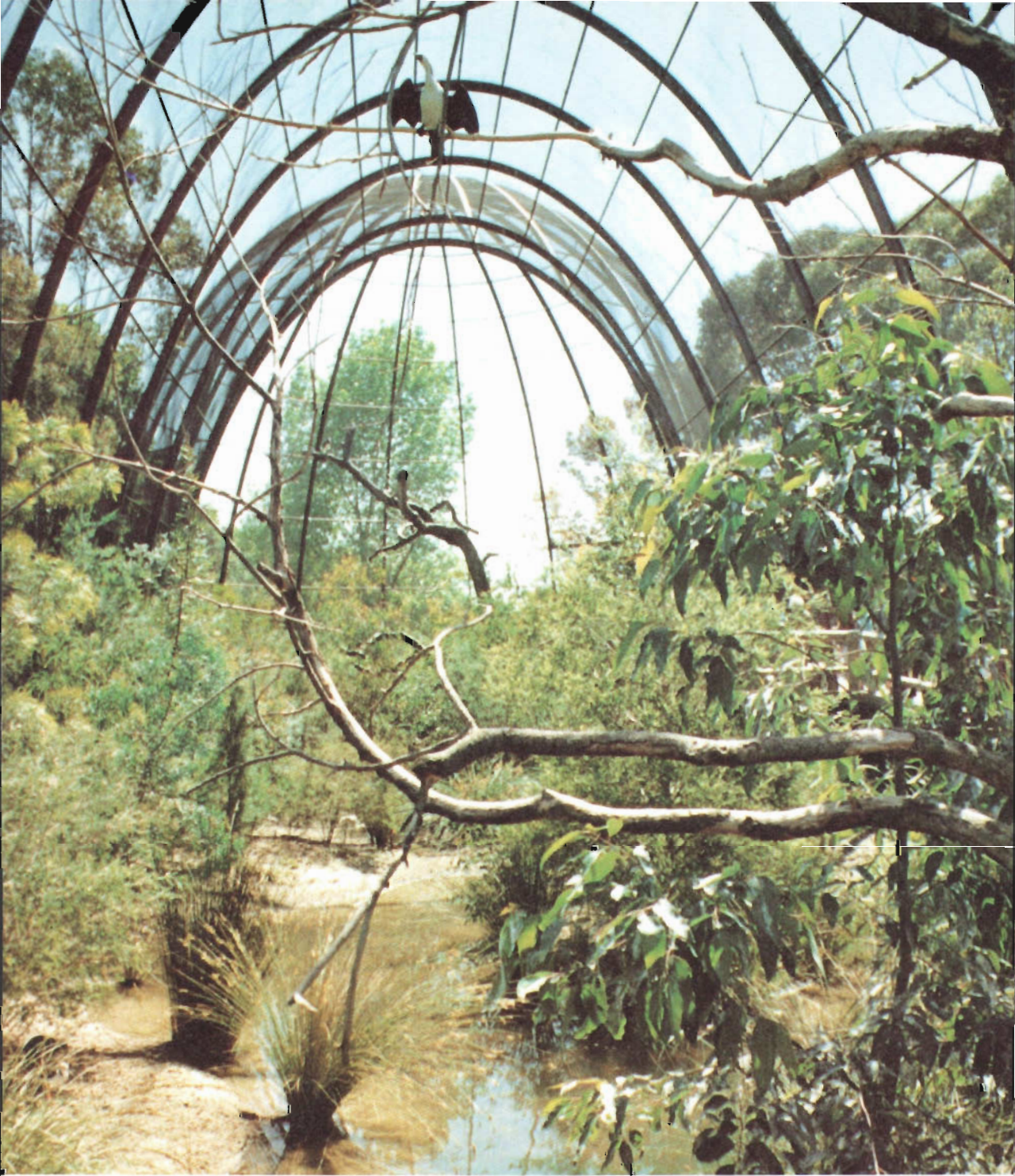
The Great Flight Aviary in which birds of three distinct Australian habitats can be seen in a background of appropriate vegetation.