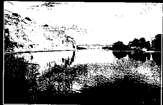
ABS Catalogue No. 1309.0

ABS publications draw extensively on information provided freely by individuals, businesses, governments and other organisations. Their continued cooperation is very much appreciated; without it the wide range of statistics published by the ABS would not be available for general use by the community. Information received by the ABS is treated in strict confidence as required by the Census and Statistics Act.