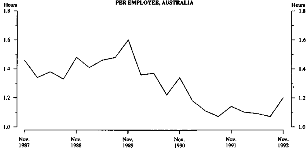
CHART 7.2. AVERAGE WEEKLY OVERTIME HOURS PER EMPLOYEE, AUSTRALIA