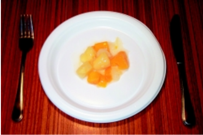
1 serve of fruit salad