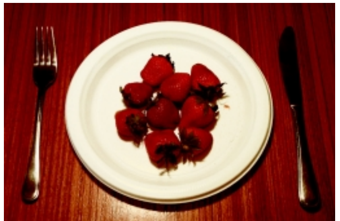
1 serve of strawberries