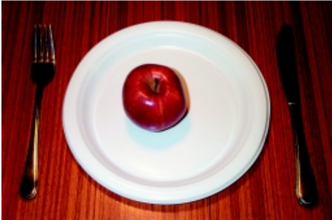
1 serve of apple