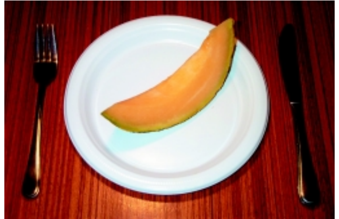
1 serve of rockmelon